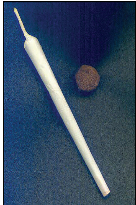
Joint of Cannabis

HASH POT WEED DOPE DRAW BLOW GRASS GANJA MARAJUANA SHIT BLACK BUSH And many more!