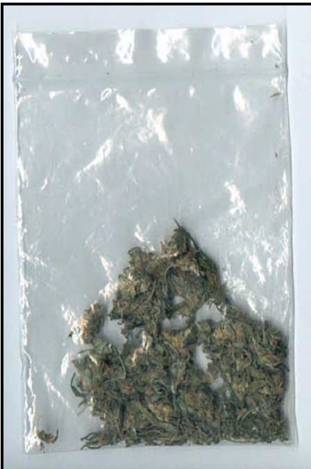
Packaged Cannabis