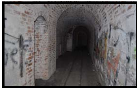
Inside the main tunnel

interest in physics and other sciences. I have investigated the paranormal for many years and have experienced