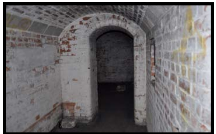
The side rooms off the main tunnel

Others have experienced similar feelings of being watched, and someone exploring the main tunnel experienced